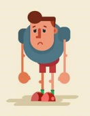
TIREDDNESS AND WEAKNESS