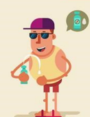
PROTECT AGAINST SUNBURN