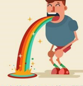
NAUSEA AND VOMITING