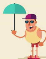
USE A UMBRELLA