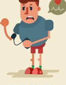
DECREASE IN BLOOD PRESSURE