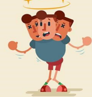
DIZZINESS AND HEADACHE