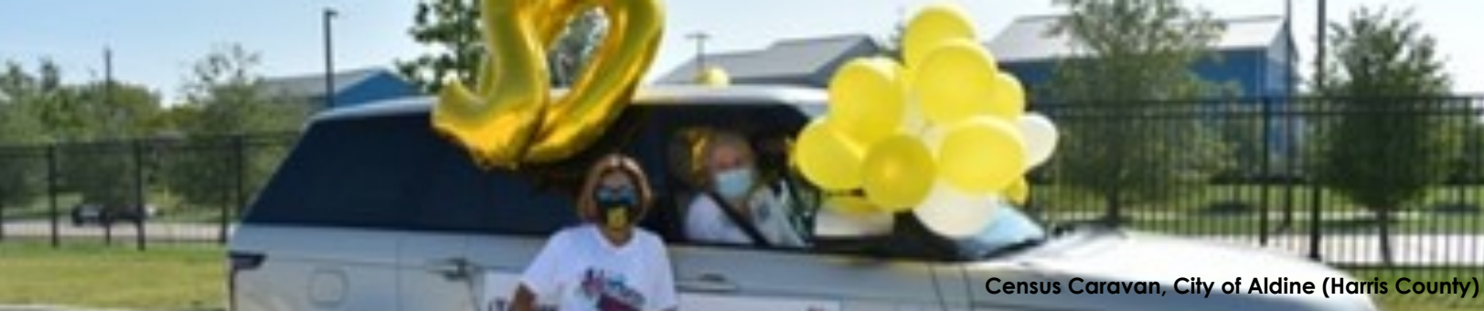
Census Caravan, City of Aldine (Harris County)