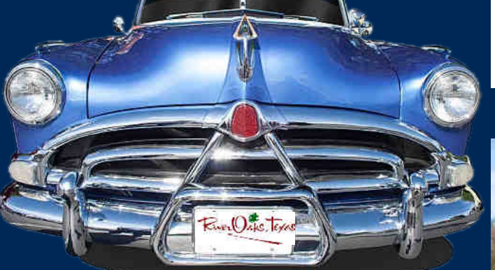
Special Awards for Best Interior, Best Engine, Etc.