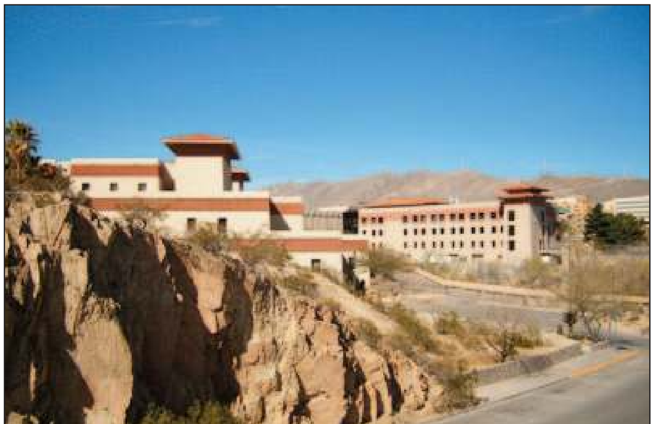
Buildings modeled after Bhutanese monasteries, or dzongs. To the left is the College of Business Administration, to the right the College of Engineering

The pursuit of knowledge can sometimes take us in unusual directions.