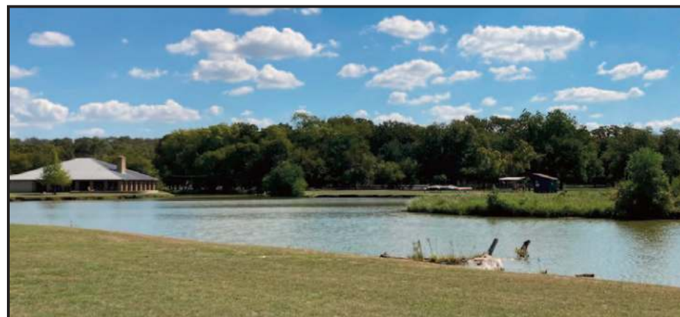
Beautiful Camp Carter pond.