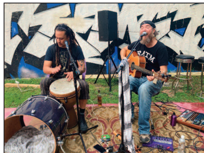
Attendees enjoyed a sense of community.