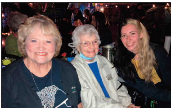
Children enjoyed dancing to the music.