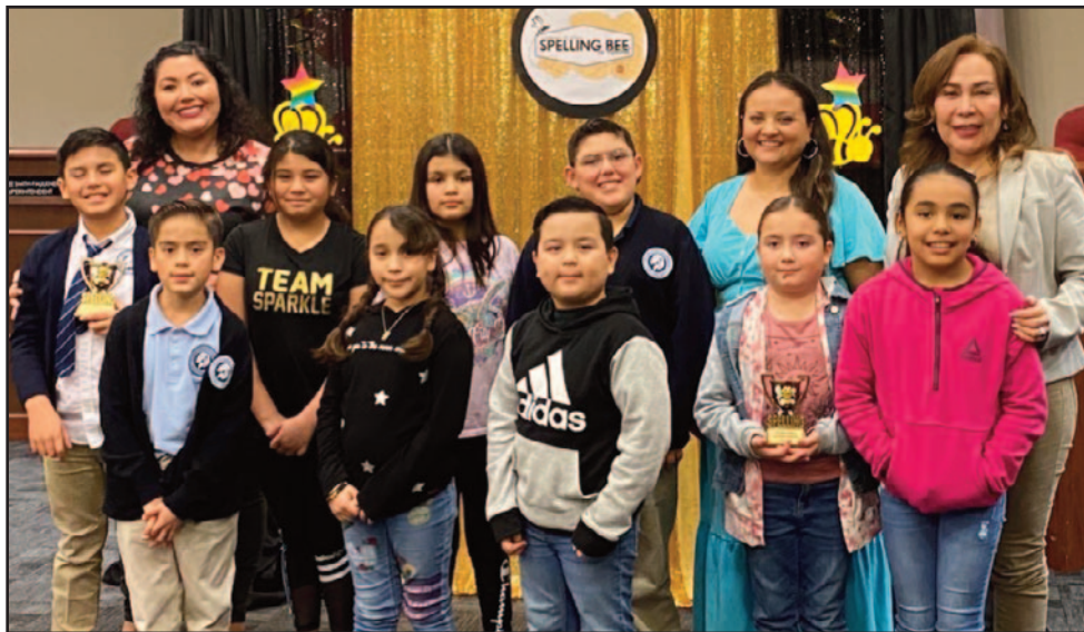
Pictured left: Fourth grade Spanish Spelling Bee contestants and teachers.