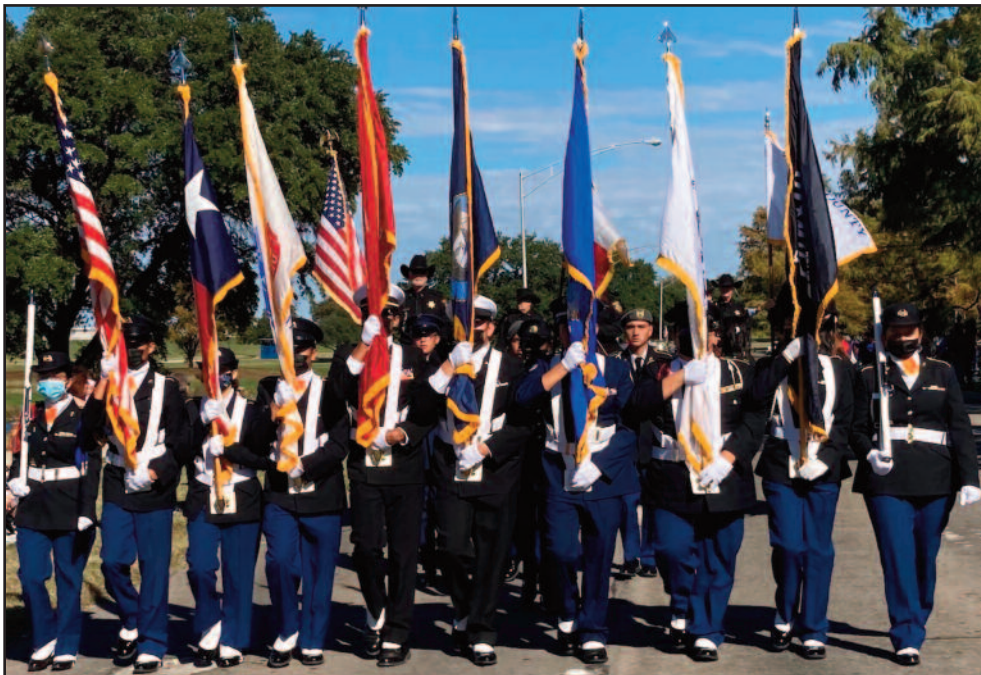
The colors began the parade with the flags of military branches.

To us, the reflection of Armistice Day is filled with solemn pride in the heroism of those who died in our country's service, with gratitude for the victories, both because it has freed us and because of the opportunity given to America to show sympathy with peace and justice in the council of all nations.