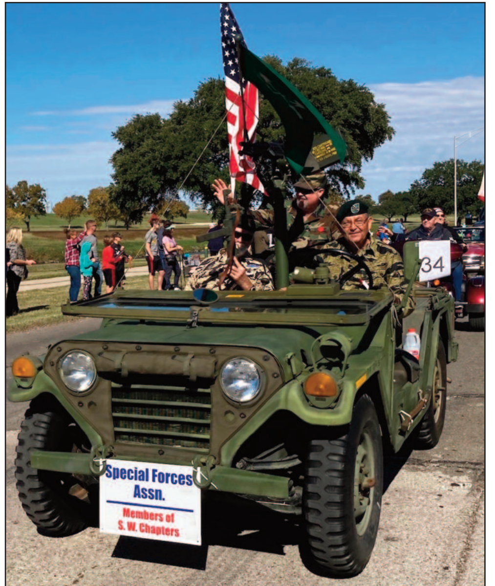
The Special Forces Association came to support the occasion.